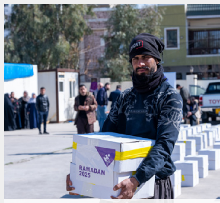
Essential Ramadan food parcels reaching communities in Iraq.