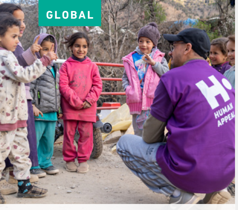
Morocco: Human Appeal staff chatting with a group of children.